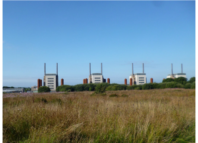
Vegetation surrounding Chapelcross