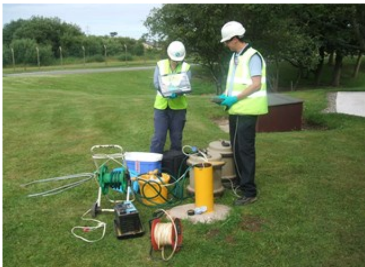
Groundwater Monitoring at Chapelcross

Under the Unified Arrangements for Regulatory Compliance in Projects During Defueling and/or Decommissioning (See Appendix B) Chapelcross ensures that decommissioning activities are carried out in accordance with the Environmental Management Plan. All changes to the system are assessed, during the proposal stage, against the requirements of the Environmental Management Plan and, where appropriate, mitigation measures are put in place to prevent impacts identified. This is a part of the integrated management system on site that is certified against ISO 9001, ISO 14001 and ISO 45001. In addition, where there is the potential for an activity to produce significant discharges or disposals, either radioactive or non-radioactive, the site undertakes appropriate optioneering studies (Best Practical Environmental Option/Best Practicable Means).