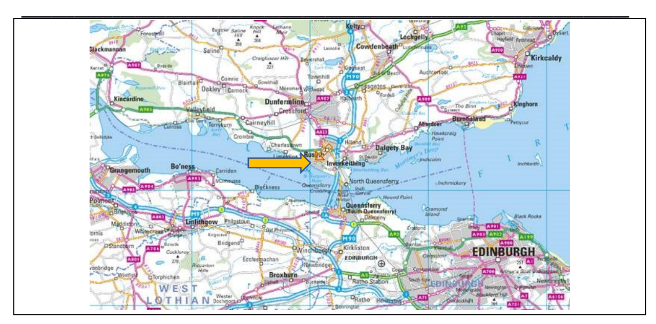
Figure 1: General Location Plan

The defueled laid up submarines are berthed on the southern side of the NTB. Dismantling is undertaken within the nuclear licensed site at Dock No. 2, a massive concrete and granite structure, with the entrance from the NTB fitted with a steel caisson. Dock drainage is normally to the NTB. Surface water from the Business Park areas discharges at authorised discharge points to the NTB and to the Forth Estuary.