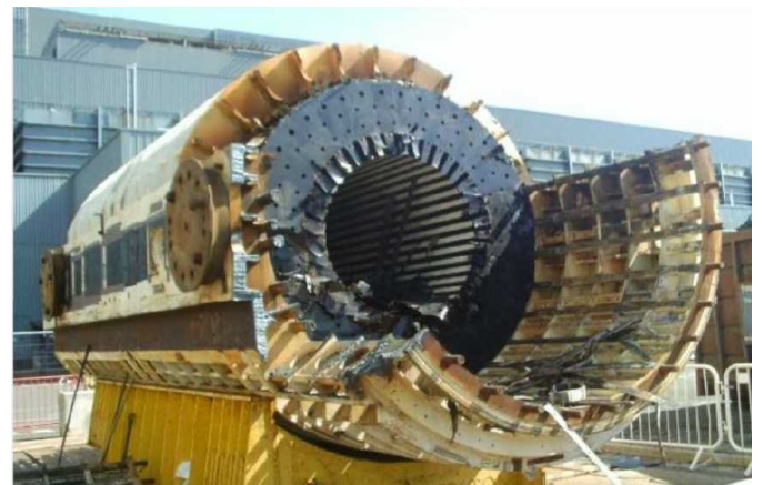
Figure 5. Redundant Stator internal

The stator shed housed a redundant stator and other redundant equipment. It was necessary to remove the shed and contents as part of the enabling works for a refurbishment of one of the waste facilities. The Stator contained asbestos materials that were appropriately managed and disposed of.