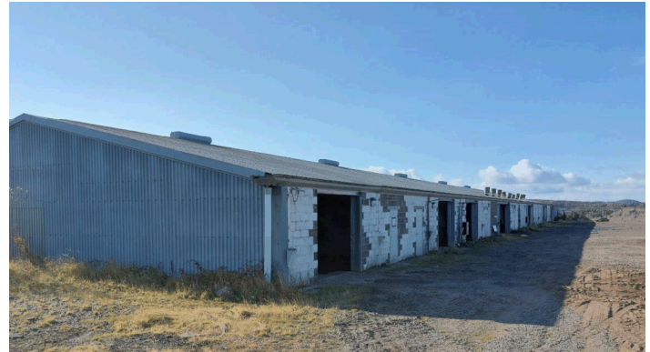
Figure 4. Old Fish Farm (storage facility) at HNB

The old Fish Farm is located outside the nuclear licensed site boundary and has been used by HNB for the storage of non-hazardous spare equipment, which is now redundant. Work has been carried out to ensure the re-use of much of the equipment by other sites or via supply chain companies. Any waste items have been removed in accordance with the site's waste management principles and standards.