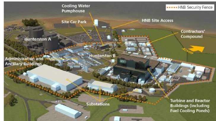
Figure 3. HNB site layout and adjoining industry

HNB comprises two Advanced Gas-cooled Reactors (AGR). Each reactor pressure vessel is cylindrical, made from steel and situated within a large concrete bio shield. During operation, the reactors were cooled using carbon dioxide. Each reactor has 4 boilers, which converted water to steam to drive the turbines located inside the Turbine Hall. The cooling of the steam was achieved using seawater through condensing units in the Turbine Hall basement. The cooling water intake and outfall structures are located in the marine environment, connected to the Turbine Hall by large underground tunnels. Other associated buildings include the Cooling Water Pump house, National Grid Substation, Workshops, Stores and Offices.