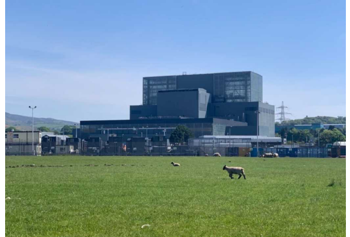
Figure 1. HNB Power Station

Other supporting information, which may be of interest to the public but is not directly required [DR1] by the consent conditions, is located in Appendix A.